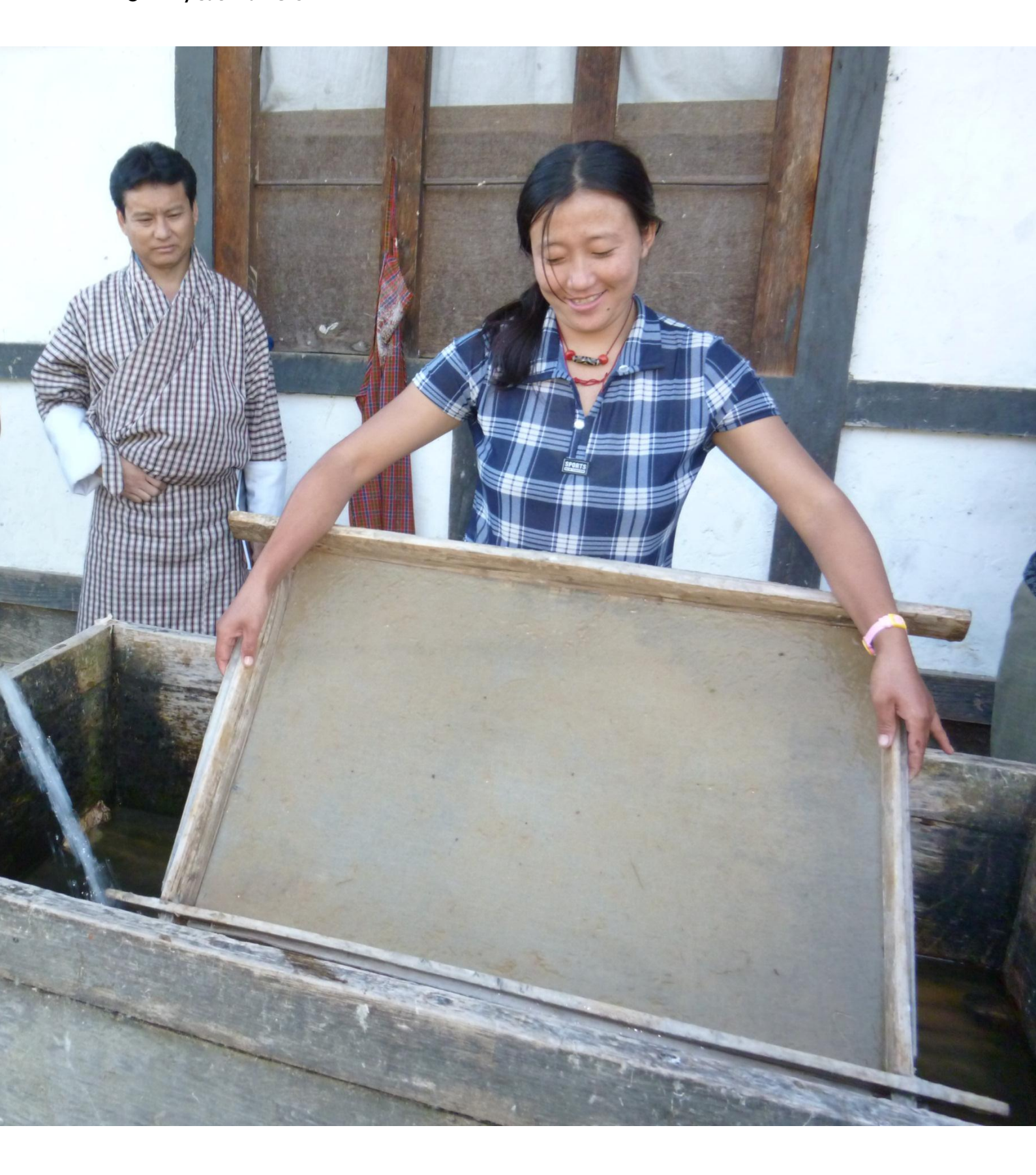
Bumdeling Paper Factory supported though the Business Opportunity Fund.